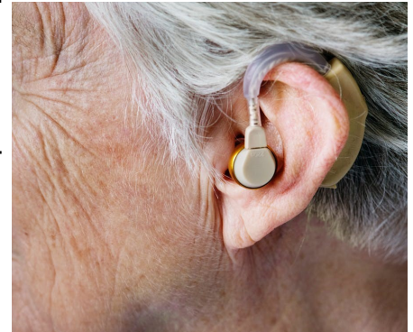
Prolonged exposure to intense noise can lead to hearing loss, and necessity of hearing aids.

One of the most common hazards in U.S. workplaces is noise. The National Institute for Occupational Safety and Health (NIOSH) estimates that 30 million workers in the U.S. are exposed to levels of noise that may not be safe. According to OSHA, "exposure to high levels of noise may cause hearing loss, create physical and psychological stress, reduce productivity, interfere with communication, and contribute to accidents and injuries by making it difficult to hear warning signals." Short term exposure can lead to a ringing in your ears or a temporary change in hearing. However, prolonged or repeated exposure causes permanent hearing loss.