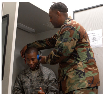
Hearing Test.

California AgrAbility assists farmworkers to obtain fitted hearing aids to help them to work safely.