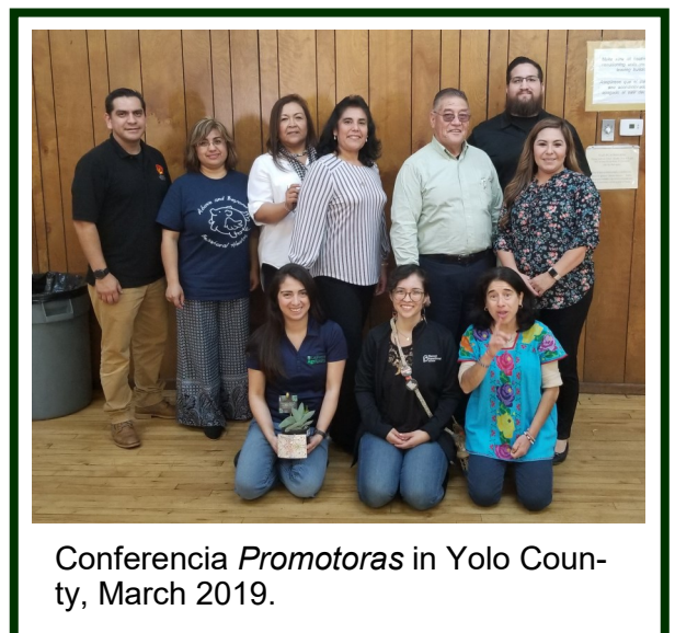
Conferencia Promotoras in Yolo County, March 2019.

This enables a large sector of our program participants to access materials and case management services in their native language and culture. We have found this to be essential to increasing the general health, health literacy, and disability and injury management skills of our program participants.